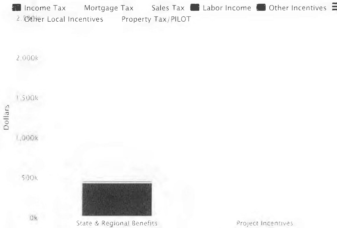
Table 2: Estimated State & Regional Benefits / Estimated Project Incentives Analysis (Discounted Present Value*)