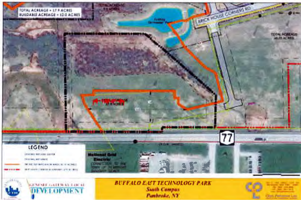
GIS Map of Property with Proposed Lot Line